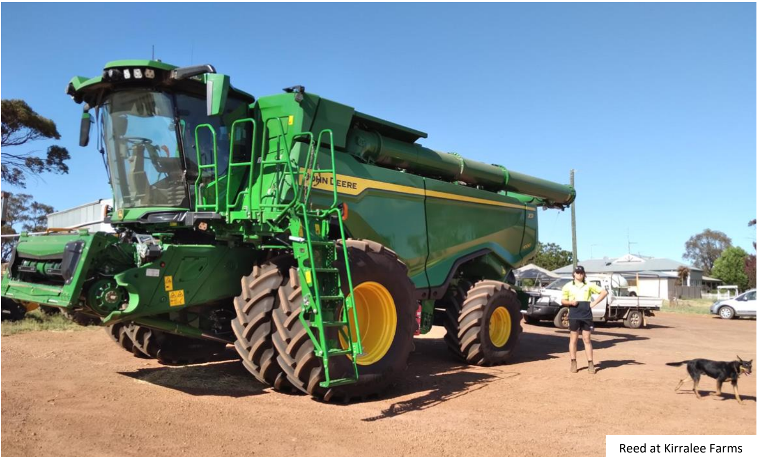
Reed at Kirrallee Farms