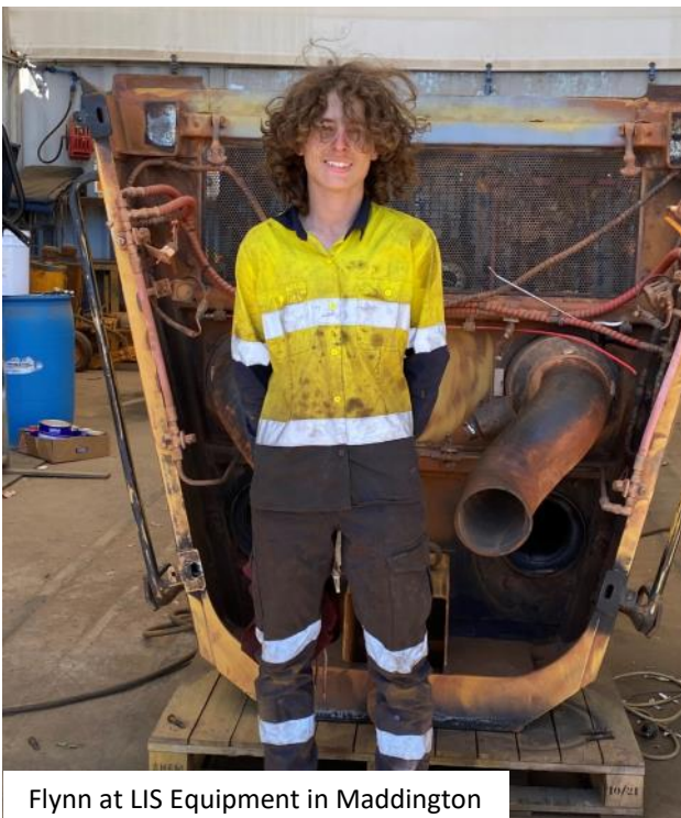
Flynn at LIS Equipment in Maddington