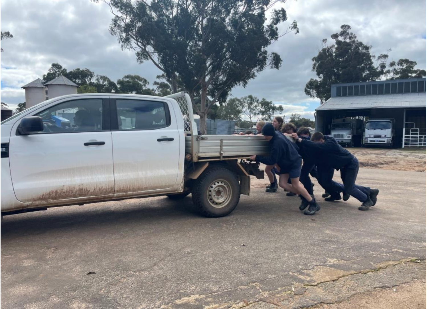
Flat battery: Year 10 students moving a ute to the Farm workshop.