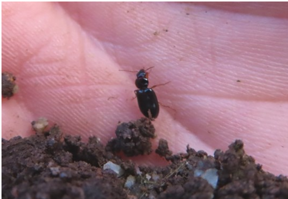
Domenic was the master at finding bugs, such as this friendly beetle, he also found some nasty mites but they were too small for the camera to see!