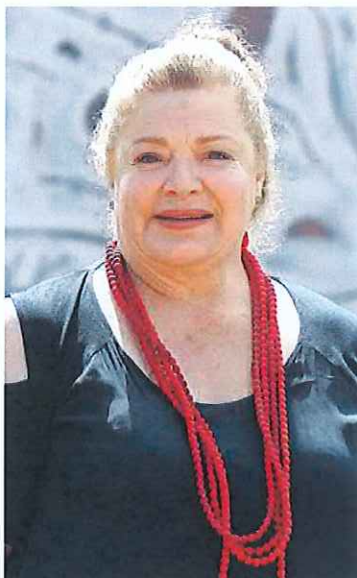
Education Minister Sue Ellery.